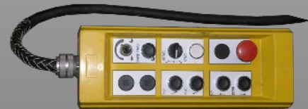
Standard hand pendant provided with all models