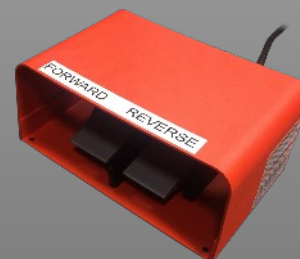
Optional foot switch controls available