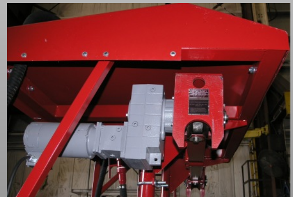
Optional powered traverse drive