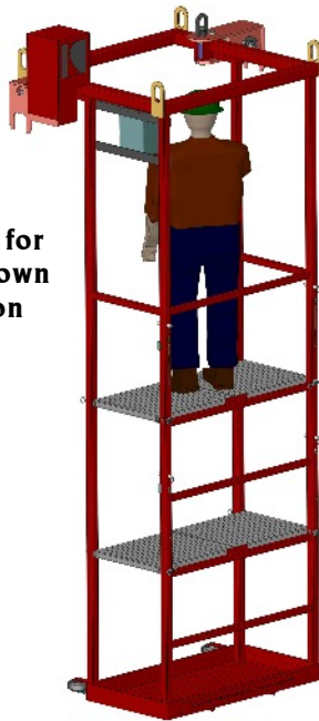
Powered drive for traversing and fold down steps for elevation

Koike Aronson / Ransome's Shell Buggy is the ideal solution for manual operations during tank construction. Supported off the top shell of the tank, the compact work platform provides the operator access to both horizontal and vertical seams for up to 10' plates. Used for preparation, cleaning or repair without the need for scaffolding. Fold down steps or power elevation provide the operator with a full reach of the entire vertical seam. Powered and manual traverse options are available, with large lifting eyes for loading and unloading on/off the tank shell. Flanged wheels and safety fingers allow for use on up to 1" thick material.