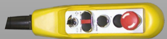
Standard hand pendant provided with all models